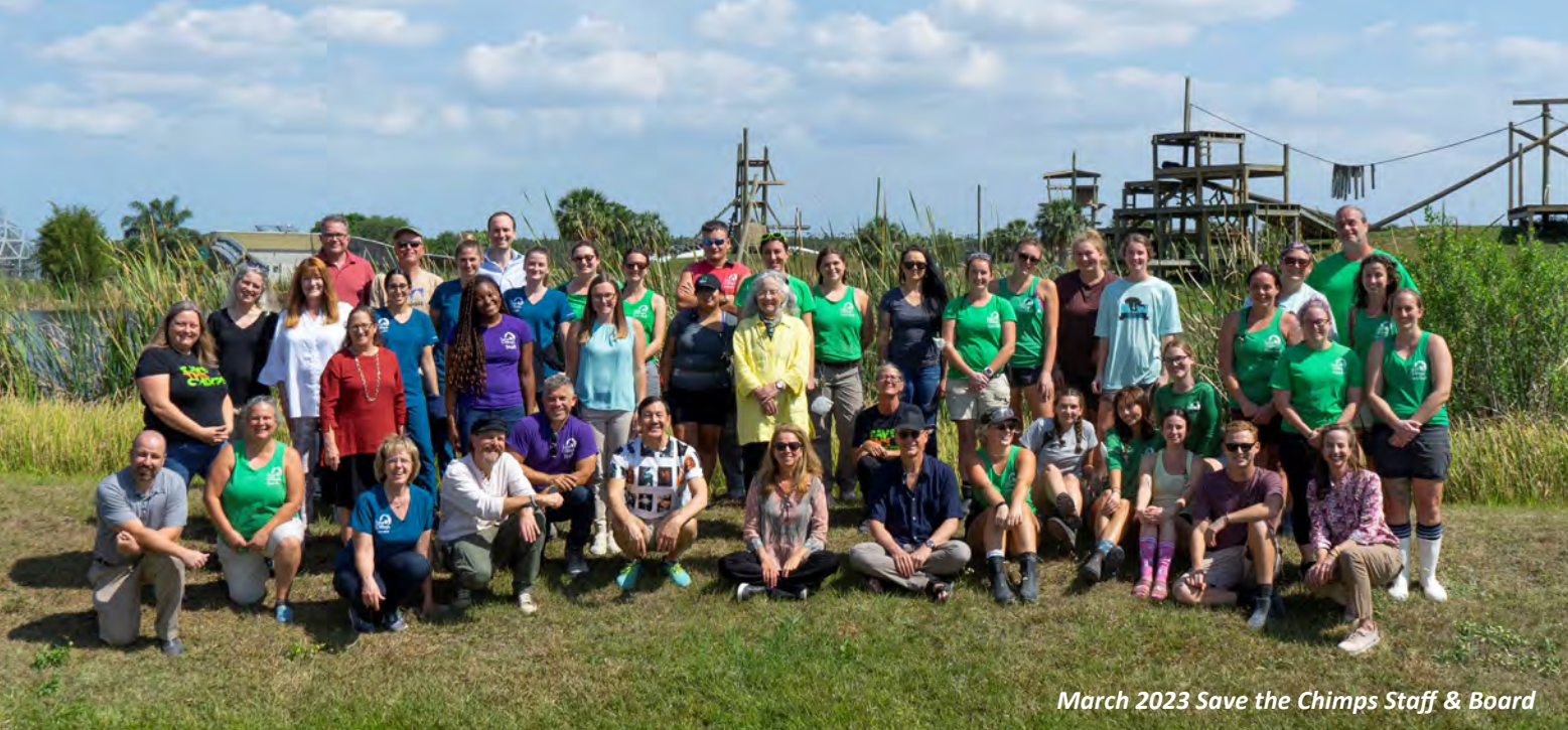
March 2023 Save the Chimps Staff & Board