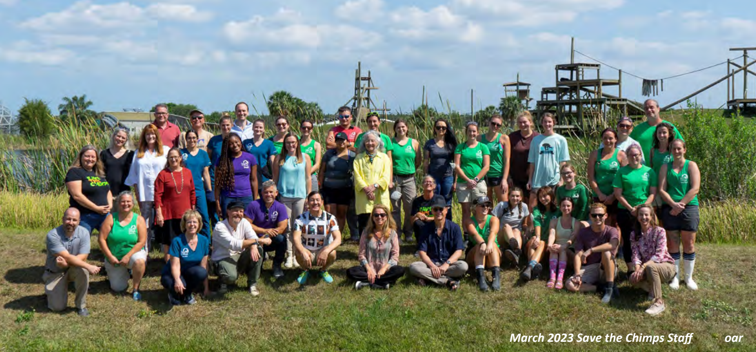
March 2023 Save the Chimps Staff oar