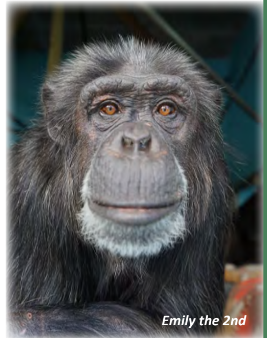
Emily the 2nd

Save the Chimps is the largest privately funded chimpanzee sanctuary in the world whose mission is to provide refuge and exemplary care to chimpanzees in need. In pursuit of the core belief that chimpanzees deserve to live free from exploitation and endangerment, the Sanctuary offers life-long care for chimpanzees retired from research laboratories, the pet trade and the entertainment industry. Thanks to its dedicated staff and amazing volunteers, Save the Chimps delivers safety and expert care to chimpanzees in need, ensuring that they can thrive in their retirement.