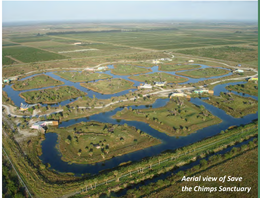
Aerial view of Save the Chimps Sanctuary